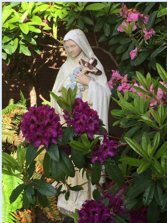
St Therese of Lisieux

The retreat begins with dinner on Friday evening & concludes after brunch on Sunday.