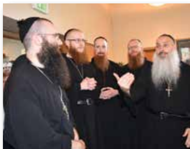
A Maronite Blessing is offered before Lunch