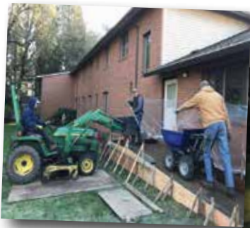
Back Entrance Ramp